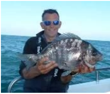
6lb 2oz black bream