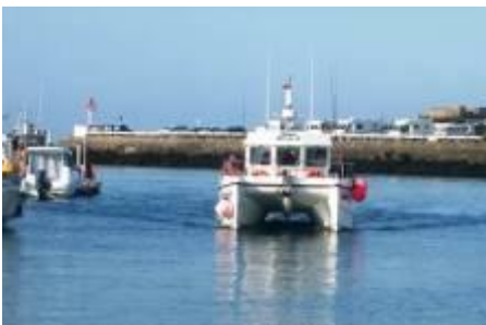
Silver Spray II entering Cherbourg

Cherbourg and Alderney trips are a real Angling holiday. It's a great way to enjoy the best boat angling that the UK has to offer. Our anglers really enjoy their evenings as well with a range of bars and restaurants for a pint, good food and of course plenty of fishy stories. Both Alderney and Cherbourg are about 60miles from Poole - Alderney is famous for its banks which hold superb flatfish while Cherbourg has many almost un-fished wrecks.