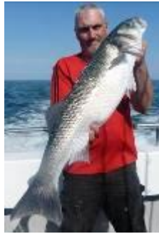
11lb 12oz bass