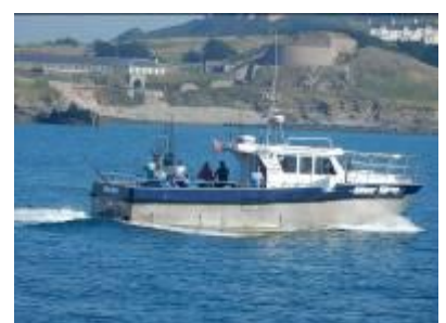
Silver Spray in Braye Harbour, Alderney

On the way over we usually focus on wreck fishing with live baiting for large pollack, lure fishing for cod and we have a spell at anchor for congers and ling.