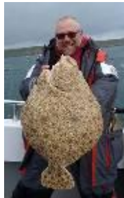
15lb 8oz turbot

The middle two days of Alderney trips focus on fishing around the island. The turbot and brill fishing are usually very good - on our best day we had over 80! Best months for "flats" are usually April, May, September and October but there were plenty right through in last year. On the final day we tend to head up the coast and fish off Cherbourg.